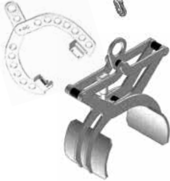
Custom Product Tongs