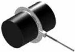
Custom Torque Wrenches for Electrodes